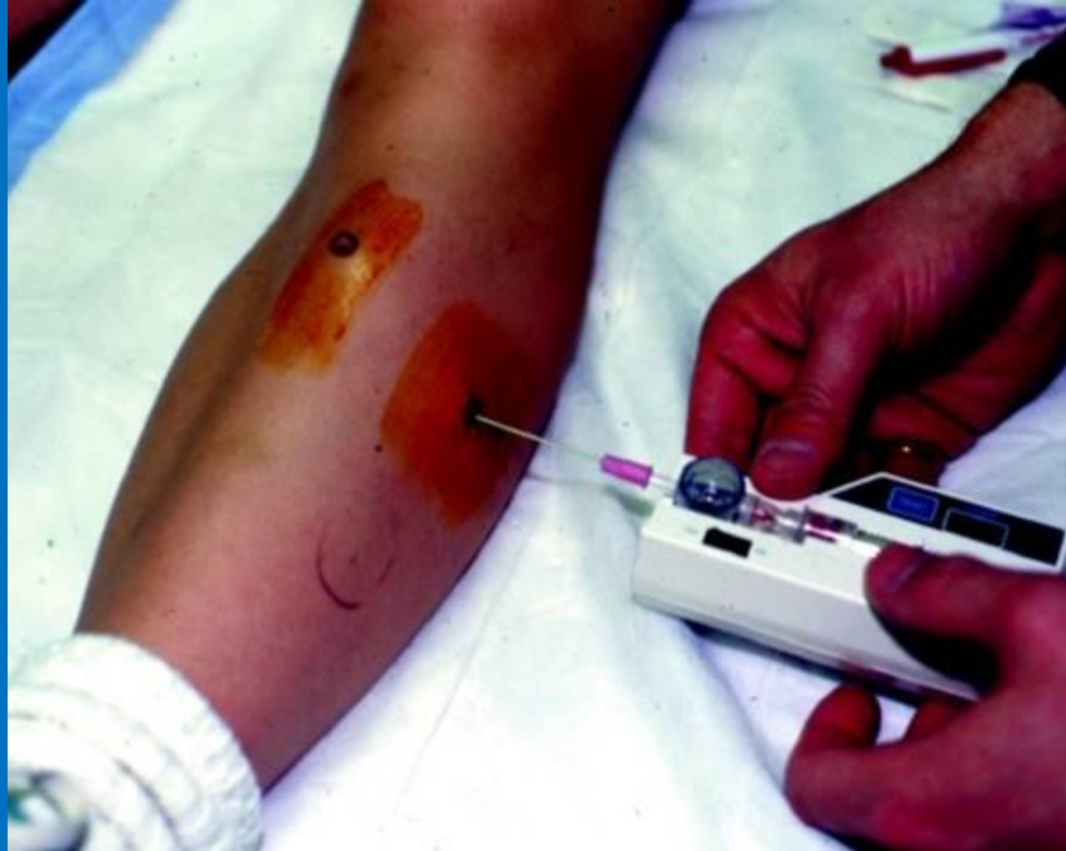
Stryker measurement - courtesy podiatry today.jpg. orthobullets.com